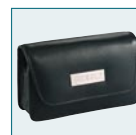
Leather case LC-W1