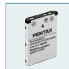
Li-Ion battery D-LI63