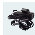
AC Mains adapter K-AC63E