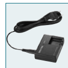
Battery charger kit K-BC63E