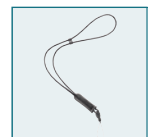
Leather strap O-ST24