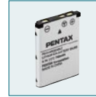
Li-Ion battery D-LI63