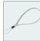
Hand strap O-ST20