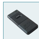
IR Remote Control E/F