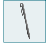
Stylus Pen O-SP63