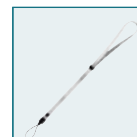
Sport strap O-ST30