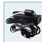
AC Mains adapter K-AC63E