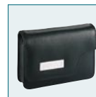
Leather case LC-T1