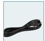
AC cable D-CO24E