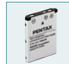
Code No. 39587 Li Ion battery D-LI63