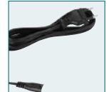
Code No. 39256 AC cable D-CO24E