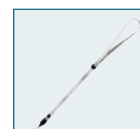
Code No. 39270 Sport Strap O-ST30