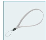
Code No. 39195 Hand strap O-ST20