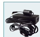
Code No. 39591 AC mains adapter K-AC64E