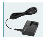
Code No. 39624 Battery charger kit K-BC63