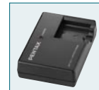
Code No. 39588 Battery charger D-BC63