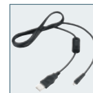
USB Cable I-USB17