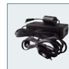
AC Mains adapter K-AC7E