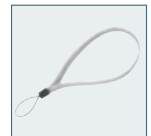
Hand strap O-ST20