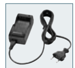
Battery charger kit K-BC8E