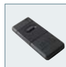
IR Remote Control E/F