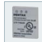
Li-Ion battery D-LI8