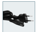
AC Cable D-CO2E