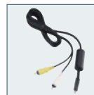
AV Cable I-AVC7