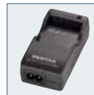
Battery charger D-BC8