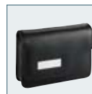
Leather case LC-T1