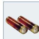
2x AA batteries