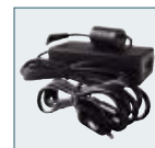
AC Mains adapter kit K-AC5E