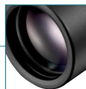
For excellent optical results: lenses fully Multi-coated, BaK4-prism, Phase correcting coating.