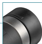
Twist-up eye cups.